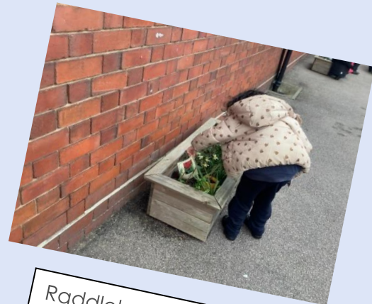
Raddlebarn in Bloom!