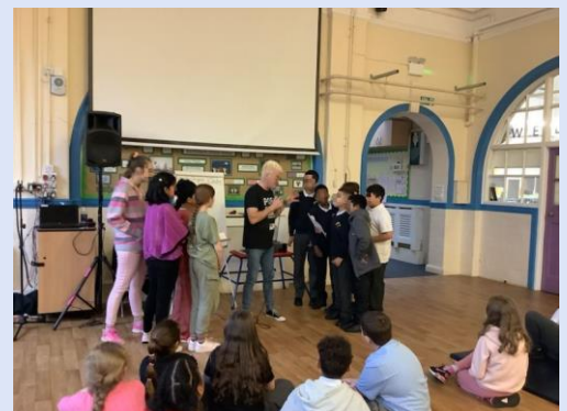
Poetry 'SLAM' workshop