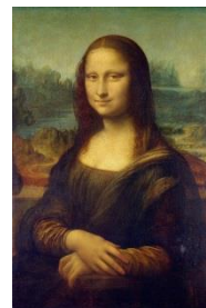
The Mona Lisa

When the artist creates a portrait of him- or herself, it is called a self-portrait .