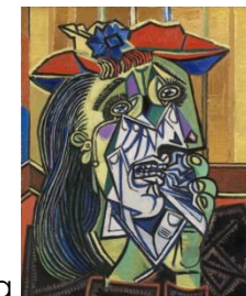
Picasso Self Portrait